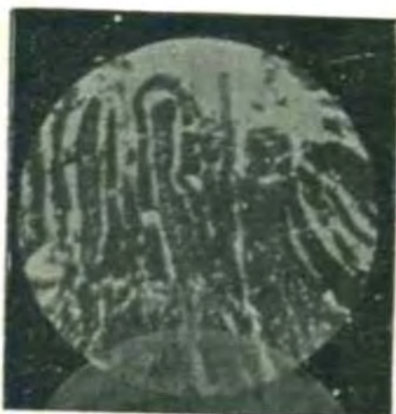
Fig. 1. Alkaline phosphatase reaction in jejunum of normal rat. ( \frac{1}{2} hour incubation) \times 300 (approx).