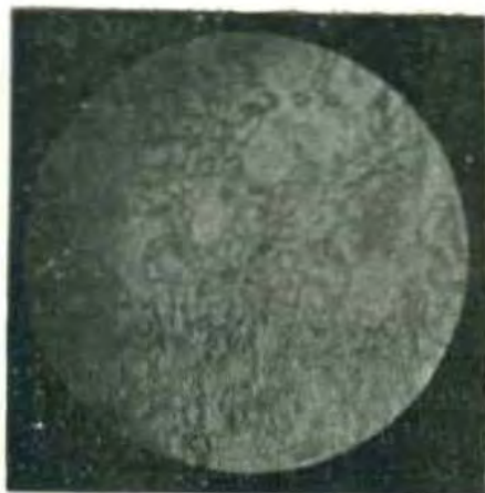
Fig. 3. Alkaline phosphatase reaction in kidney of normal rat. ( \frac{1}{2} hour incubation) \times 300 (approx).