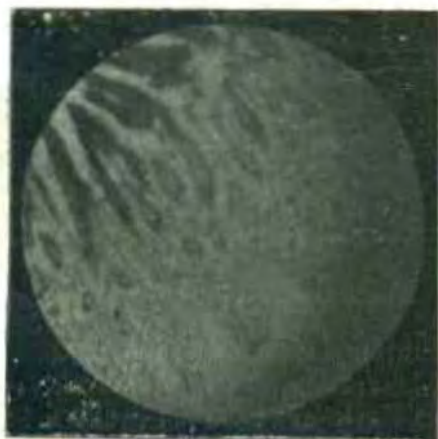
Fig. 7. Alkaline phosphatase reaction in jejunum of adrenalectomised rat. ( \frac{1}{2} hour incubation) \times 300 (appro).