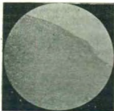
Fig. 5. Alkaline phosphatase reaction in Suprarenal of thyroidectomised rat. ( \frac{1}{2} hour incubation) \times 300 (appro).