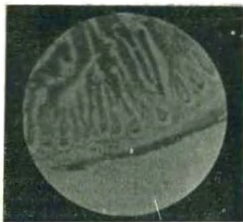
Fig. 8. Alkaline phosphatase reaction in jejunum of adrenalectomised rat receiving Desoxycorticosterone acetate. ( \frac{1}{2} hour incubation) \times 300 (appro).