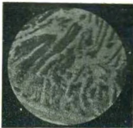
Fig. 4. Alkaline phosphatase reaction in jejunum of thyroidectomized rat. ( \frac{1}{2} hour incubation) \times 300 (approx).