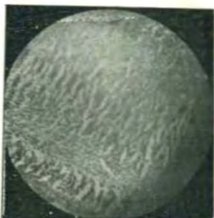
Fig. 2. Alkaline phosphatase reaction in Suprarenal of normal rat. ( \frac{1}{2} hour incubation) \times 300 (approx).